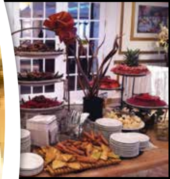
SPRING VALLEY MEADOWS