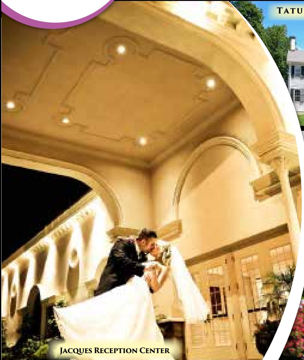
JACQUES RECEPTION CENTER